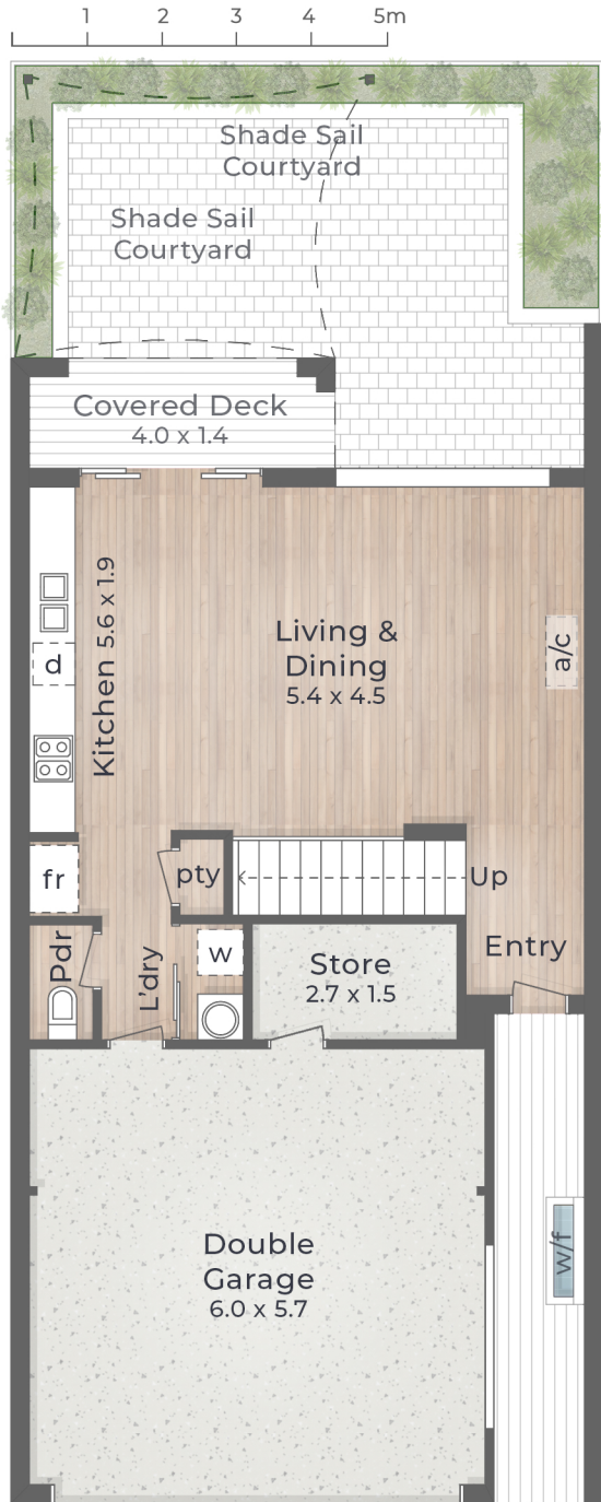
:: FLOOR PLAN - Ground Floor 2.6m Ceiling